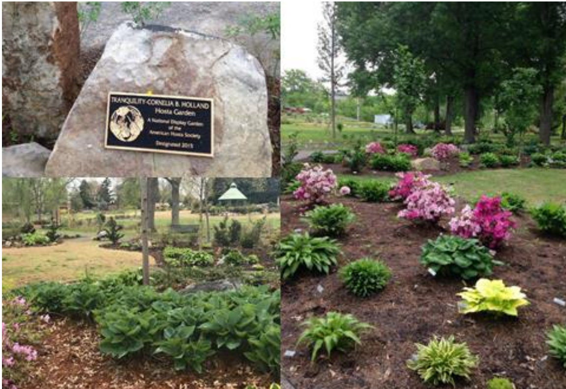
Figure 2. The “ Tranquility – Cornelia B. Holland Hosta Garden ” at the University of Tennessee Gardens, Knoxville, Tennessee.

with red petioles were planted so visitors could see and enjoy the red stems. Fragrant hostas were planted in masse in a large common area of the garden where future events could be held.