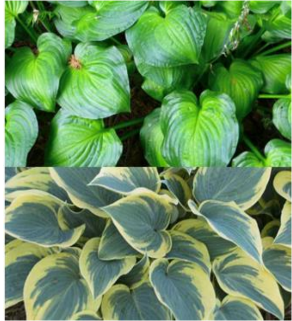
Figure 4. 'Guacamole' and 'First Frost' hostas.

The garden will also include a large selection of the original hosta species, which are the mother plants for today's vast selection of hybrids. Many of these hostas are rare and almost impossible to find. This large portion of the garden will be designated as a species area for housing and preserving the parents of today's hybrid varieties.