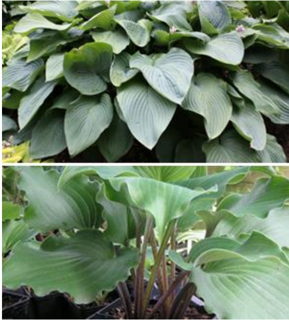
Figure 3. 'Empress Wu' (top) and 'Marylin Monroe' (bottom) hosta.